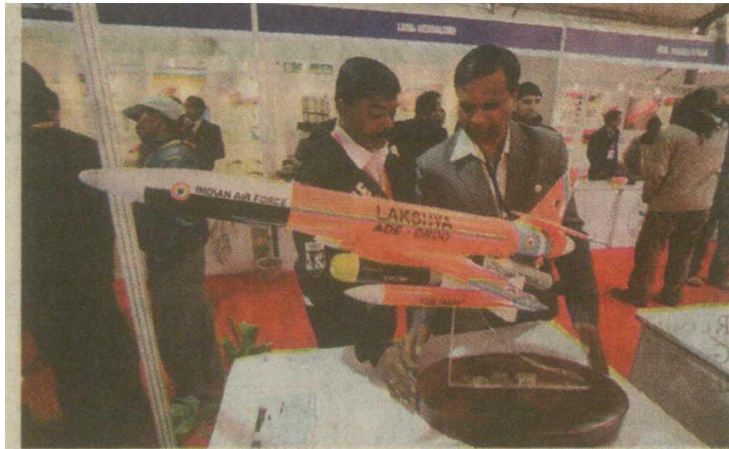
A delegate displays a model of Lakshya, high speed target drone system developed by Defence Research and Development Organisation (DRDO), at the 101st Indian Science Congress in Jammu on Monday