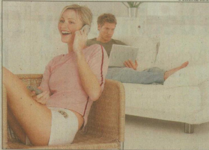
SIGNAL FOR CHANGE.