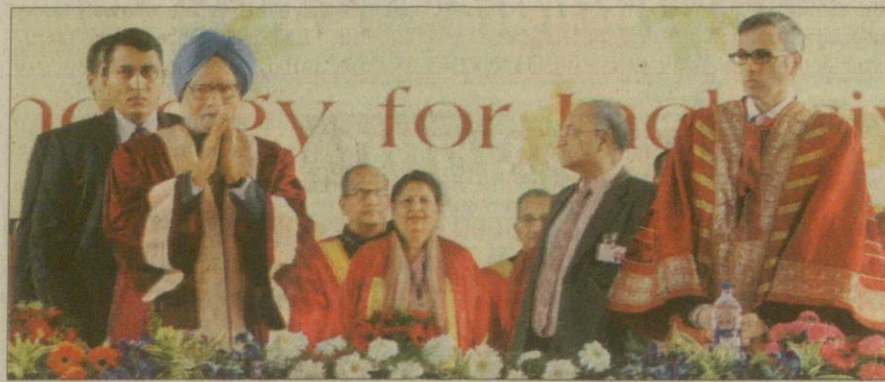
Prime Minister Manmohan Singh and J&K Chief Minister Omar Abdullah at the 101st Indian Science Congress, in Jammu on Monday.