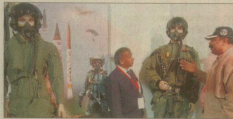
A delegate at the DRDO stall during the 101st Indian Science Congress in Jammu on Monday.

The fellowship comprises $100,000 for scientists in addition to a Rs 55-lakh grant. Moreover, the host institute will receive Rs 10 lakh to support the facility and infrastructure needed for the pro-